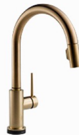
Delta Trinsic Single-Handle Pull-Down Sprayer Kitchen Faucet, $470, homedepot.com