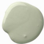
Pigeon, Farrow & Ball