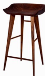
Walnut counter stool, $495, organicmodernism.com