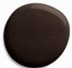
Ebony floor stain, minwax.com