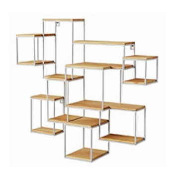
GEOMETRIC SHELF NETWORK WALL SHELF, $200, LANDOFNOD.COM