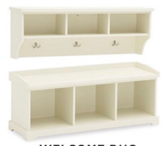
WELCOME DUO SAMANTHA ENTRYWAY BENCH & SHELF SET, $679, POTTERYBARN.COM