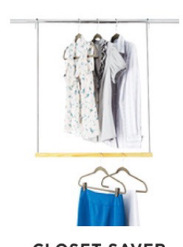
CLOSET SAVER LYNK DOUBLE HANG CLOSET ROD, $13. CONTAINERSTORE.COM