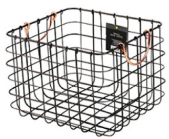
CUTE CRATE SMALL MILK CRATE WIRE BASKET, $13, TARGET.COM